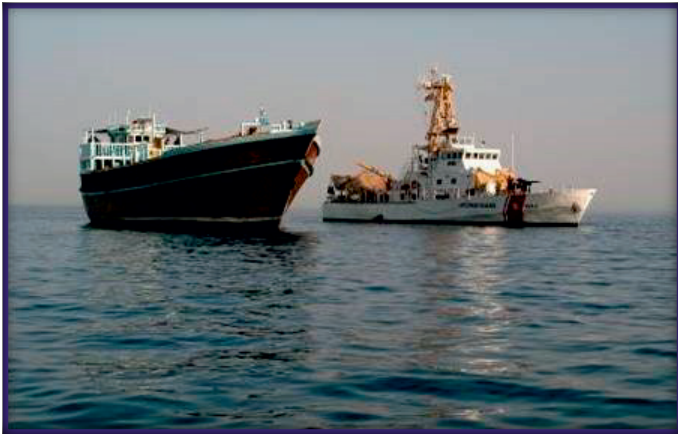
CGC Adak performs maritime interdiction operations. The cutter is seen here with a local dhow typically used for regional commerce.