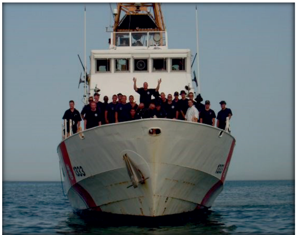
Crew of CGC Adak posed for a group photo on the bow of the 110-foot cutter.

It took a week to complete minesweeping operations on the KAA and with Umm Qasr in coalition hands, cargo vessels could begin steaming into the Iraqi port. Naval combat operations concluded near the end of March, but Mackenzie and Adak joined the other WPBs to continue their force protection role and serve as escorts while Navy salvage vessels Catawba and Grapple removed obstructions in the waterway. On March 28, coalition forces sent the first shipment of humanitarian aid into Umm Qasr on board the shallow-draft Royal Fleet Auxiliary Sir Galahad under the escort of Adak , Wrangell , a minesweeper and patrol craft Firebolt . Adak and its crew continued escort duties along the KAA into April. On April 11, Adak escorted Iraq's first commercial shipment on board motor vessel Manar which carried 700 tons of Red Crescent Society aid