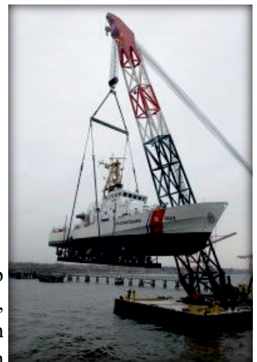
110-foot CGC Adak being loaded on board a Military Sealift Command vessel destined for the Middle East.

In the days leading up to combat operations, Adak focused on maritime interdiction