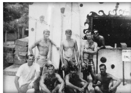
1968 Vietnam veteran surfers