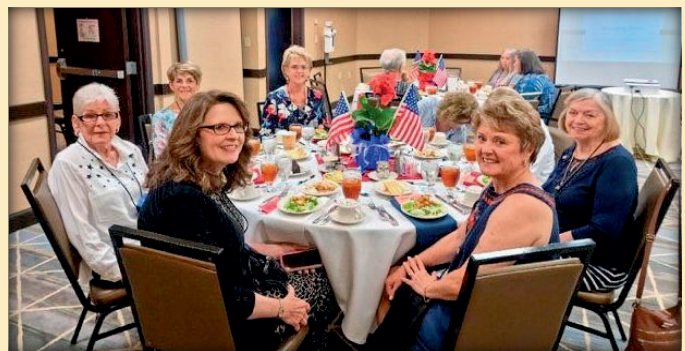
Auxiliary Luncheon Attendees