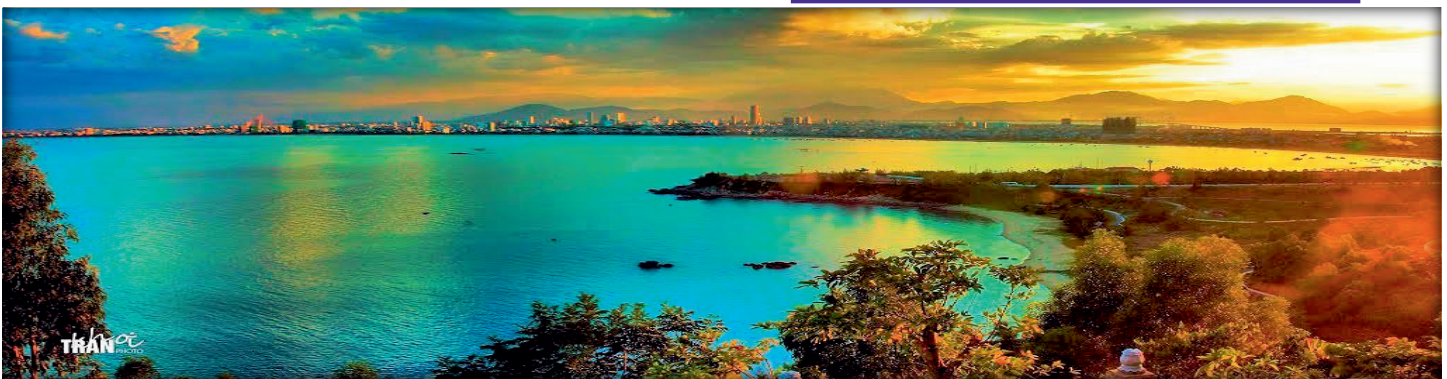
My Khe Beach—Da Nang 2021