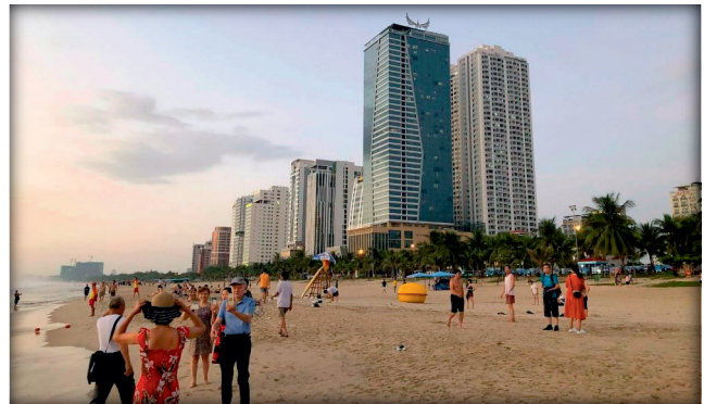
My Khe Beach 2021

Jake Newby can be reached at jnewby@pnj.com or 850-435-8538.